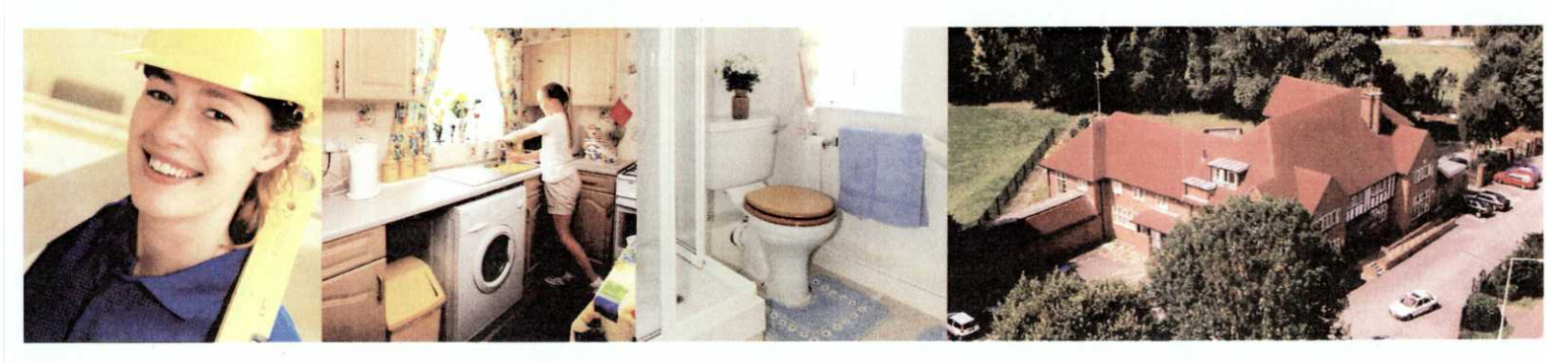
One of our apprentices.

We've achieved even more than we set out to do. During the first five years, we have completed 22,223 improvements - on time, within budget and to the full satisfaction of our customers.