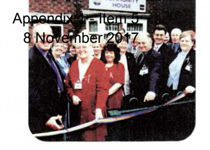
Official opening of the Brownley Green Community House.