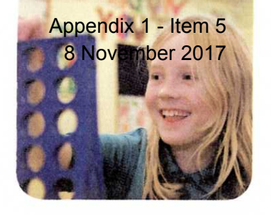
Plenty to smile about as Willow Park prepares to deliver the next phase of work.